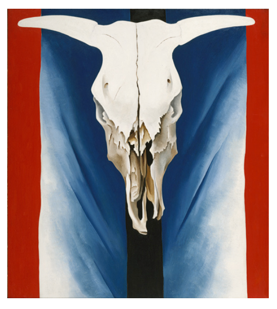
Cow's Skull: Red, White, and Blue, 1931 by Georgia O'Keeffe

View examples of Georgia's bone and skull <u>paintings on the web</u> or in books such as those available on <u>Amazon</u>.